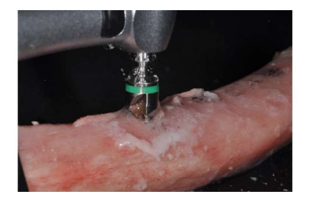
Fig. 3. Area of cortical bone during the end phase of implant bed preparation.

The maximum and mean temperature variations that were seen during drilling in the designated area were displayed in Table I. The highest temperatures that were measured were below the level that is thought to be dangerous for bone health.